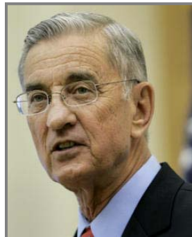
Millard Fuller 1935-2009

Habitat for Humanity lost a significant personage when its founder, Millard Fuller, died on February 3rd of an apparent heart attack, en route to the hospital near his home in Americus, Georgia. He was 74.