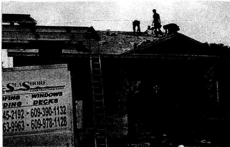
SeaShore Construction Corp. crew braves a very hot July day to put the roof on our Cochran Street house in Whitesboro.