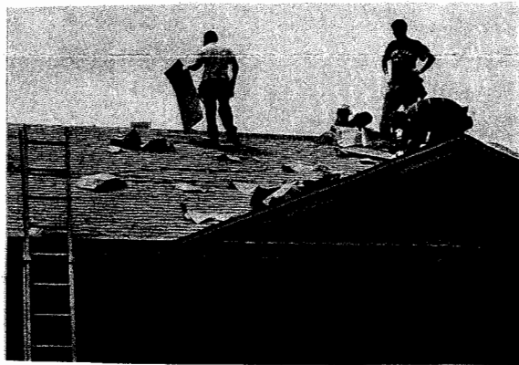
We're proud to be United Way!

Thanks to a laptop computer given to us by Cape Savings Bank, we are now able to use Habitrak, a Habitat International program useful for tracking volunteers, expenses, income, and just about anything else you can think of.