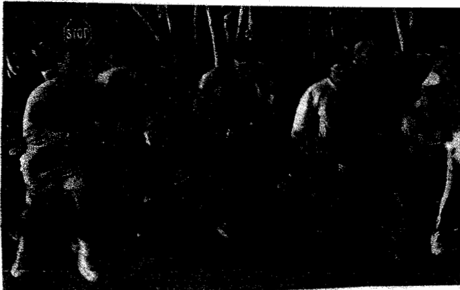
Runners got off to a fast start on a cold and windy Saturday after Thanksgiving.